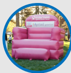
(1) BIG PINK CHAIR