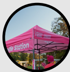
(1) POP-UP TENT