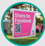
(5) YARD SIGNS